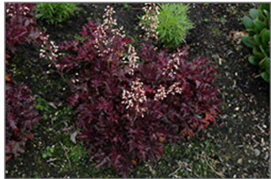
Blackberry Crisp Coral Bells in bloom

Moana Lane Garden Center & Corporate Office 1100 W. Moana Lane Reno, NV 89509 (775) 825-0600 (775) 825-0602 - Corporate Office