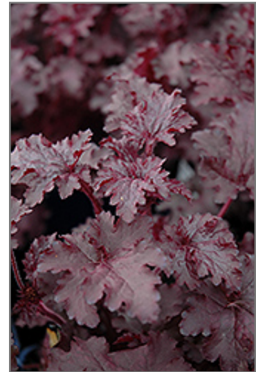
Blackberry Crisp Coral Bells foliage

Blackberry Crisp Coral Bells will grow to be about 18 inches tall at maturity extending to 24 inches tall with the flowers, with a spread of 18 inches. When grown in masses or used as a bedding plant, individual plants should be spaced approximately 15 inches apart. Its foliage tends to remain dense right to the ground, not requiring facer plants in front. It grows at a medium rate, and under ideal conditions can be expected to live for approximately 10 years. As an evergreen perennial, this plant will typically keep its form and foliage year-round.