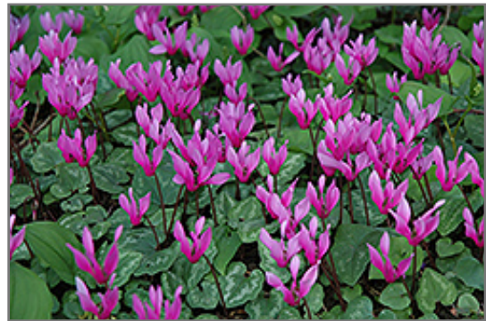
Purple Cyclamen in bloom