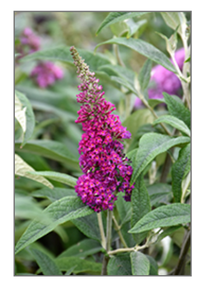
Miss Ruby Butterfly Bush flowers