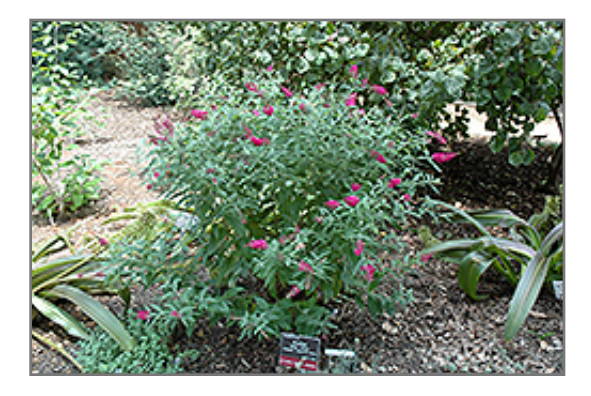
Miss Ruby Butterfly Bush in bloom