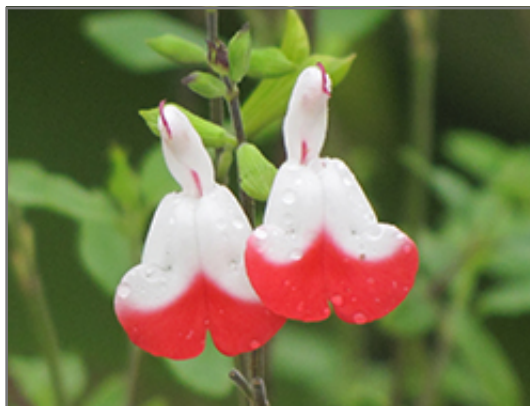
Hot Lips Sage flowers

This is a relatively low maintenance plant, and should only be pruned after flowering to avoid removing any of the current season's flowers. It is a good choice for attracting bees, butterflies and hummingbirds to your yard, but is not particularly attractive to deer who tend to leave it alone in favor of tastier treats. It has no significant negative characteristics.