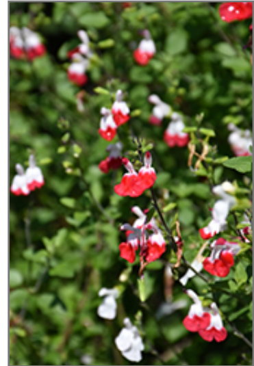
Hot Lips Sage flowers

Hot Lips Sage is a fine choice for the garden, but it is also a good selection for planting in outdoor pots and containers. With its upright habit of growth, it is best suited for use as a 'thriller' in the 'spiller-thriller-filler' container combination; plant it near the center of the pot, surrounded by smaller plants and those that spill over the edges. It is even sizeable enough that it can be grown alone in a suitable container. Note that when growing plants in outdoor containers and baskets, they may require more frequent waterings than they would in the yard or garden.