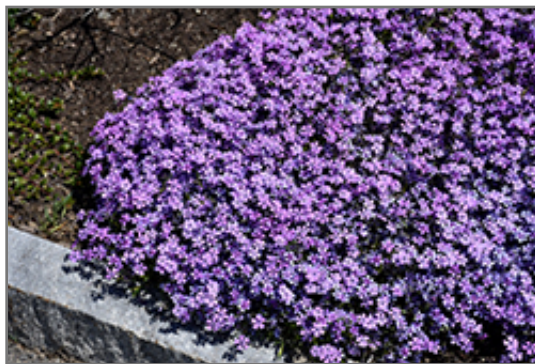
Purple Beauty Moss Phlox in bloom