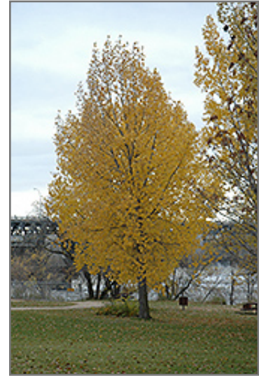
Siouxland Poplar in fall