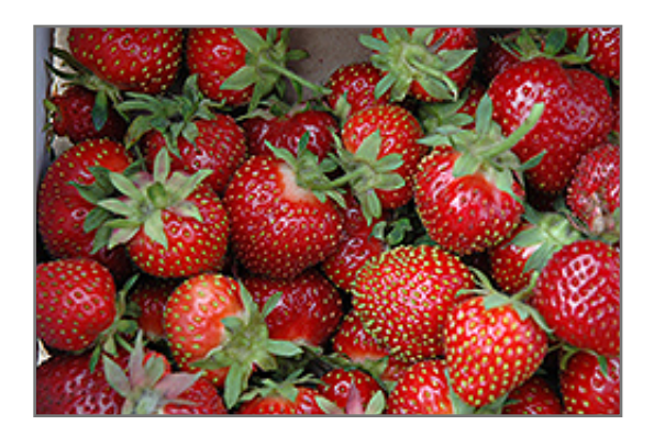
Chandler Strawberry fruit

Chandler Strawberry features dainty white daisy flowers with yellow eyes along the stems in mid spring. Its tomentose round compound leaves remain green in color throughout the season. It features an abundance of magnificent cherry red berries in early summer.