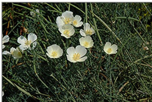
Prairie Sunset Rain Lily flowers