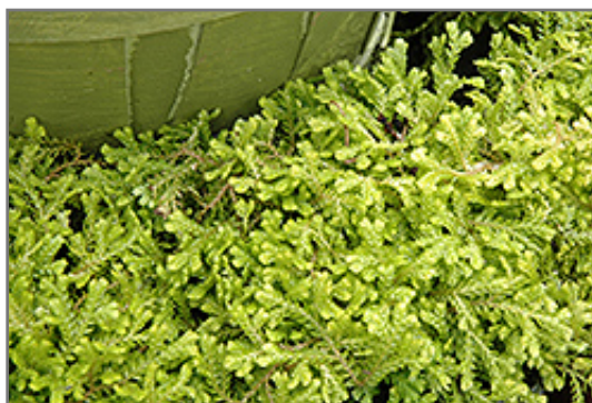
Golden Spikemoss foliage