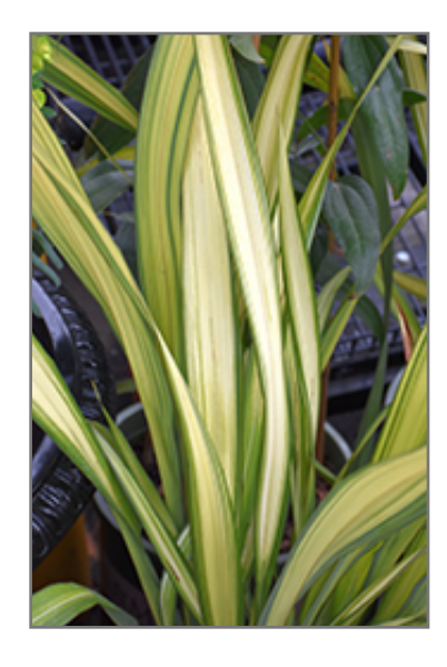
Yellow Wave New Zealand Flax foliage