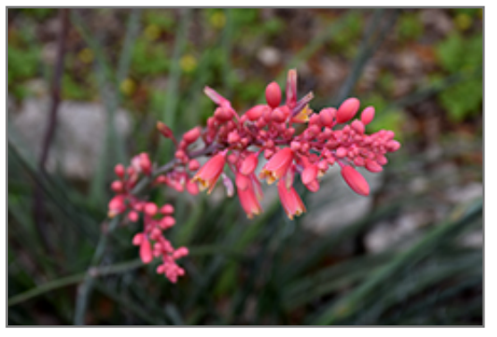
Red Yucca flowers

Moana Lane Garden Center & Corporate Office South Virginia St. Garden Center 1100 W. Moana Lane Reno, NV 89509 (775) 825-0600 (775) 825-0602 - Corporate Office