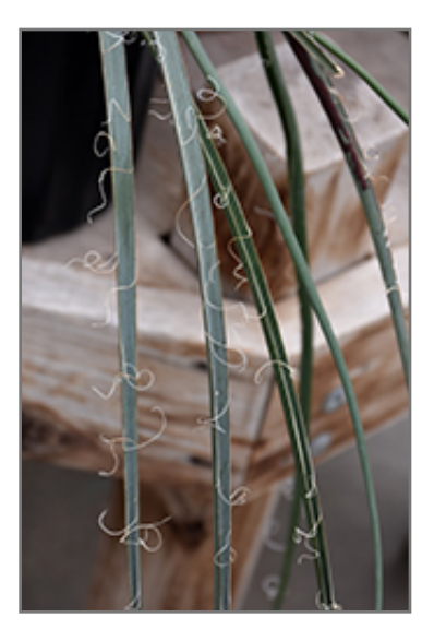
Red Yucca foliage

This plant should only be grown in full sunlight. It prefers dry to average moisture levels with very well-drained soil, and will often die in standing water. It may require supplemental watering during periods of drought or extended heat. It is not particular as to soil pH, but grows best in poor soils. It is highly tolerant of urban pollution and will even thrive in inner city environments. This species is native to parts of North America. It can be propagated by division.