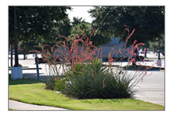
Red Yucca in bloom

Red Yucca is recommended for the following landscape applications;