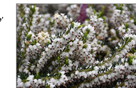
Mediterranean White Heath flowers