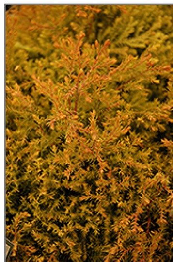
Fire Chief White Cedar foliage