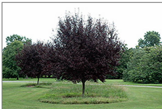
Krauter Vesuvius Plum

This tree should only be grown in full sunlight. It does best in average to evenly moist conditions, but will not tolerate standing water. It may require supplemental watering during periods of drought or extended heat. It is not particular as to soil type or pH. It is highly tolerant of urban pollution and will even thrive in inner city environments. Consider applying a thick mulch around the root zone in both summer and winter to conserve soil moisture and protect it in exposed locations or colder microclimates. This is a selected variety of a species not originally from North America.