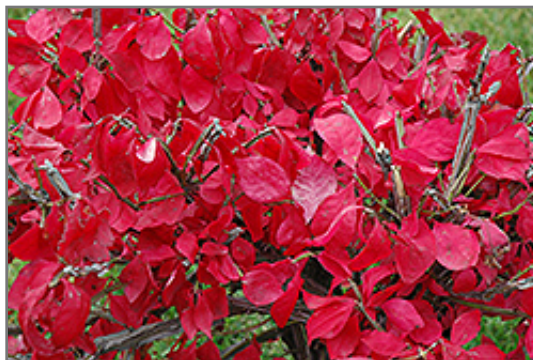
Dwarf Burning Bush in fall