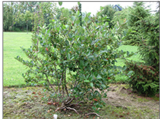
Viking Chokeberry