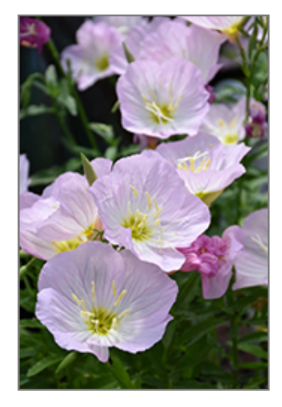
Siskiyou Mexican Evening Primrose flowers