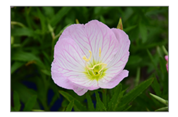
Siskiyou Mexican Evening Primrose flowers

Moana Lane Garden Center & Corporate Office South Virginia St. Garden Center 1100 W. Moana Lane Reno, NV 89509 (775) 825-0600 (775) 825-0602 - Corporate Office