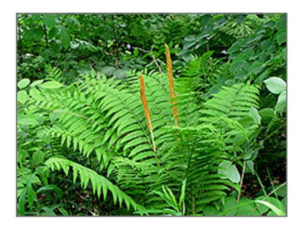
Cinnamon Fern in bloom

Cinnamon Fern is recommended for the following landscape applications;