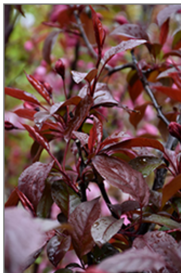
Perfect Purple Flowering Crab foliage