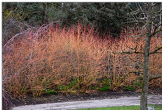
Midwinter Fire Dogwood in winter