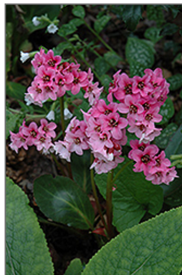
Pink Dragonfly Bergenia flowers