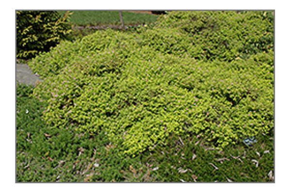
Golden Elf Spirea