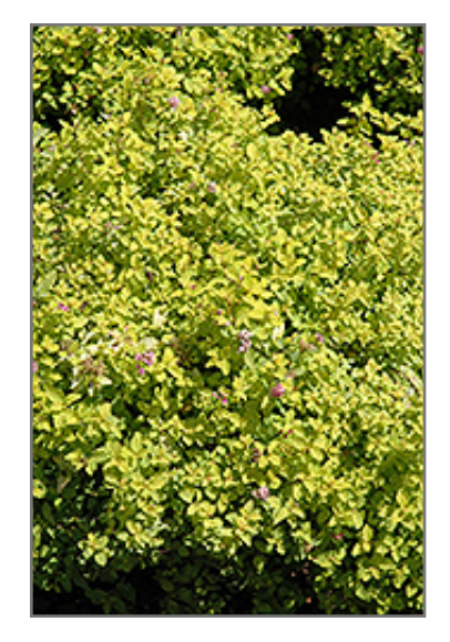
Golden Elf Spirea foliage

Moana Lane Garden Center & Corporate Office South Virginia St. Garden Center 1100 W. Moana Lane Reno, NV 89509 (775) 825-0600 (775) 825-0602 - Corporate Office