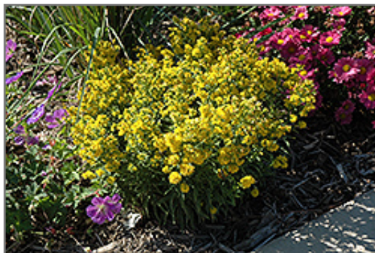
Goldrush Goldenrod in bloom