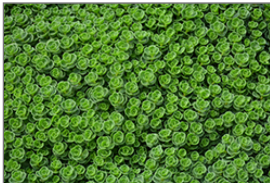
John Creech Stonecrop foliage

John Creech Stonecrop will grow to be only 3 inches tall at maturity, with a spread of 12 inches. When grown in masses or used as a bedding plant, individual plants should be spaced approximately 10 inches apart. Its foliage tends to remain low and dense right to the ground. It grows at a fast rate, and under ideal conditions can be expected to live for approximately 10 years. As an herbaceous perennial, this plant will usually die back to the crown each winter, and will regrow from the base each spring. Be careful not to disturb the crown in late winter when it may not be readily seen!