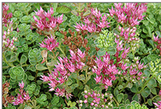
John Creech Stonecrop flowers