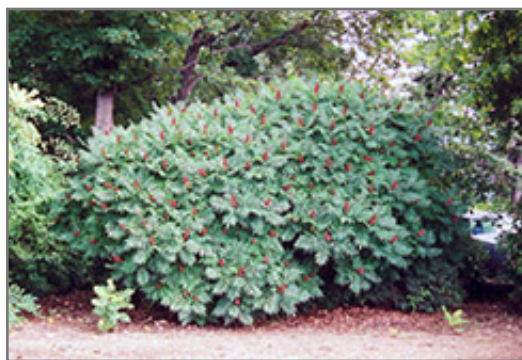
Smooth Sumac in bloom