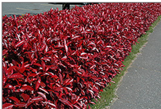
Fraser Photinia

This shrub performs well in both full sun and full shade. It is very adaptable to both dry and moist growing conditions, but will not tolerate any standing water. It may require supplemental watering during periods of drought or extended heat. It is not particular as to soil type or pH. It is highly tolerant of urban pollution and will even thrive in inner city environments. Consider applying a thick mulch around the root zone in both summer and winter to conserve soil moisture and protect it in exposed locations or colder microclimates. This particular variety is an interspecific hybrid.