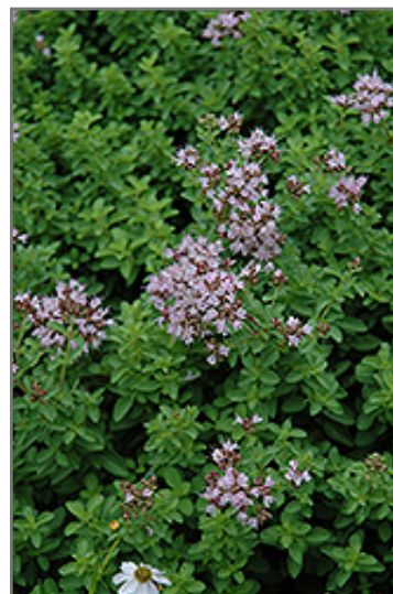
Dwarf Oregano flowers

This is an herbaceous evergreen perennial herb with a spreading, ground-hugging habit of growth. It brings an extremely fine and delicate texture to the garden composition and should be used to full effect. This is a relatively low maintenance plant, and should be cut back in late fall in preparation for winter. It is a good choice for attracting butterflies to your yard, but is not particularly attractive to deer who tend to leave it alone in favor of tastier treats. It has no significant negative characteristics.