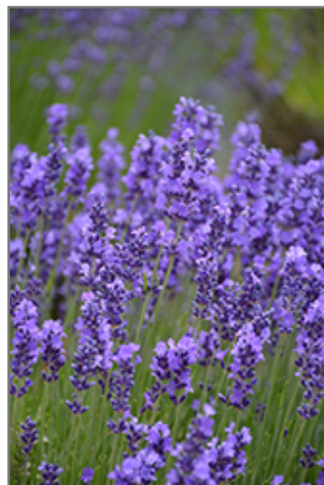
Hidcote Lavender flowers