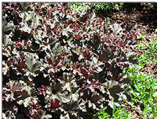
Purple Petticoats Coral Bells