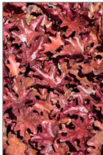
Peach Flambe Coral Bells foliage

This is a relatively low maintenance plant, and should be cut back in late fall in preparation for winter. It is a good choice for attracting hummingbirds to your yard. It has no significant negative characteristics.