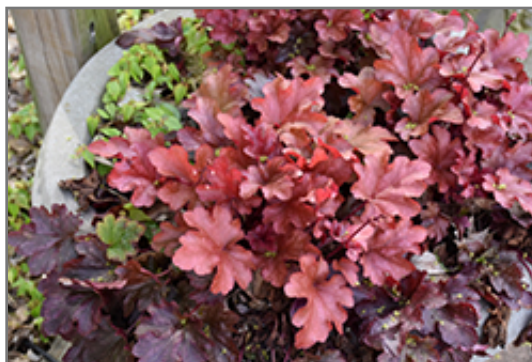
Peach Flambe Coral Bells

Peach Flambe Coral Bells will grow to be about 8 inches tall at maturity extending to 16 inches tall with the flowers, with a spread of 16 inches. When grown in masses or used as a bedding plant, individual plants should be spaced approximately 14 inches apart. Its foliage tends to remain low and dense right to the ground. It grows at a medium rate, and under ideal conditions can be expected to live for approximately 10 years. As an evergreen perennial, this plant will typically keep its form and foliage year-round.