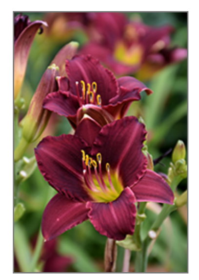
Ruby Stella Daylily flowers