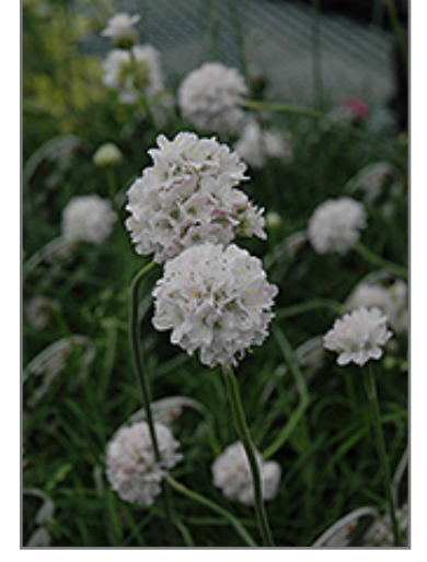
White Sea Thrift flowers