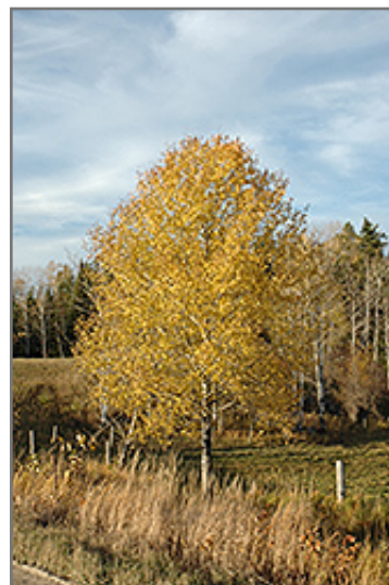
Quaking Aspen in fall

This tree should only be grown in full sunlight. It is an amazingly adaptable plant, tolerating both dry conditions and even some standing water. It may require supplemental watering during periods of drought or extended heat. It is not particular as to soil type or pH. It is quite intolerant of urban pollution, therefore inner city or urban streetside plantings are best avoided. Consider applying a thick mulch around the root zone in both summer and winter to conserve soil moisture and protect it in exposed locations or colder microclimates. This species is native to parts of North America.