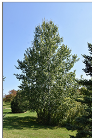
Quaking Aspen