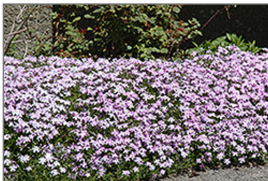
Emerald Blue Moss Phlox in bloom

Emerald Blue Moss Phlox will grow to be only 4 inches tall at maturity, with a spread of 18 inches. When grown in masses or used as a bedding plant, individual plants should be spaced approximately 15 inches apart. Its foliage tends to remain low and dense right to the ground. It grows at a medium rate, and under ideal conditions can be expected to live for approximately 10 years. As an evergreen perennial, this plant will typically keep its form and foliage year-round.