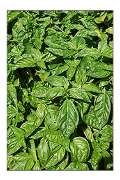
Sweet Basil foliage