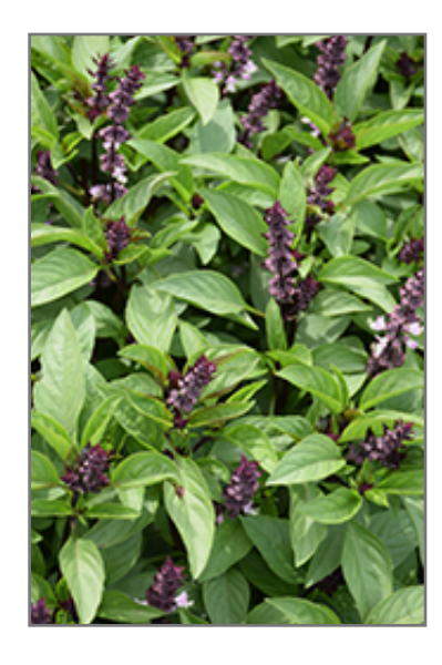
Sweet Basil flowers

Sweet Basil is a good choice for the edible garden, but it is also well-suited for use in outdoor pots and containers. It is often used as a 'filler' in the 'spiller-thriller-filler' container combination, providing the canvas against which the larger thriller plants stand out. Note that when growing plants in outdoor containers and baskets, they may require more frequent waterings than they would in the yard or garden.