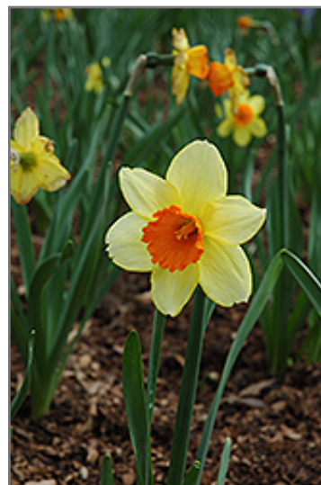
Fortissimo Daffodil flowers