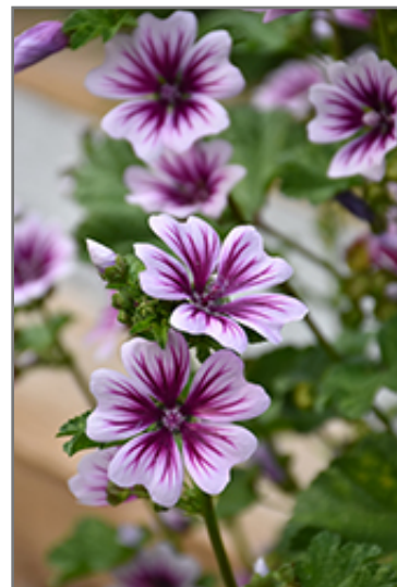
Zebrina Mallow flowers