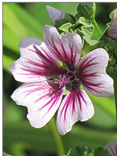
Zebrina Mallow flowers