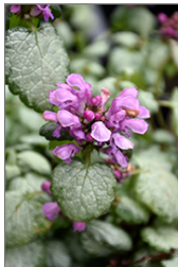
Red Nancy Spotted Dead Nettle flowers