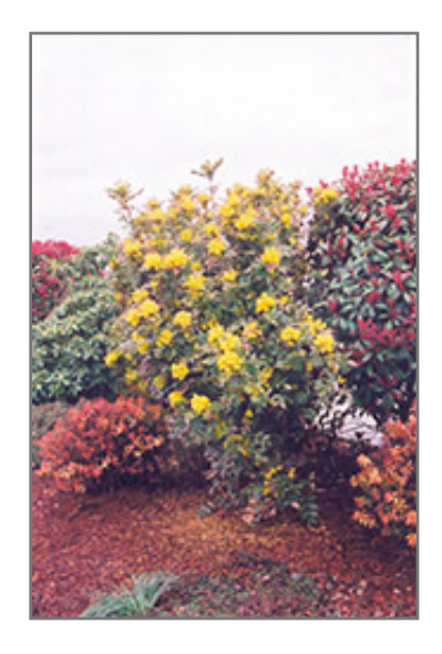
Oregon Grape in bloom