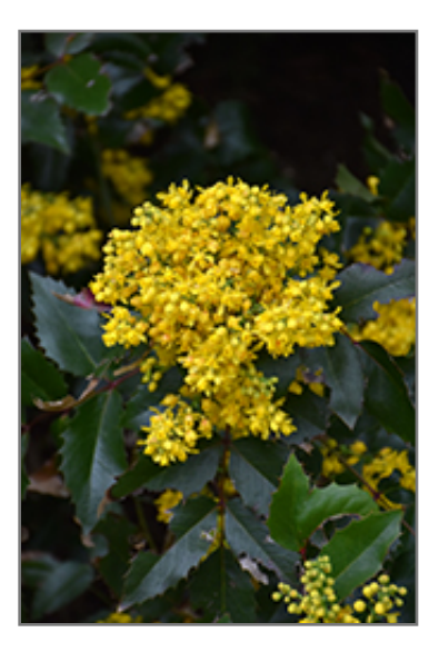
Oregon Grape flowers

Oregon Grape is recommended for the following landscape applications;