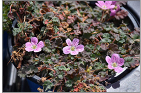
Bishop's Form Heron's Bill flowers

Other Names: Heronsbill, Stork's Bill, Storksbill