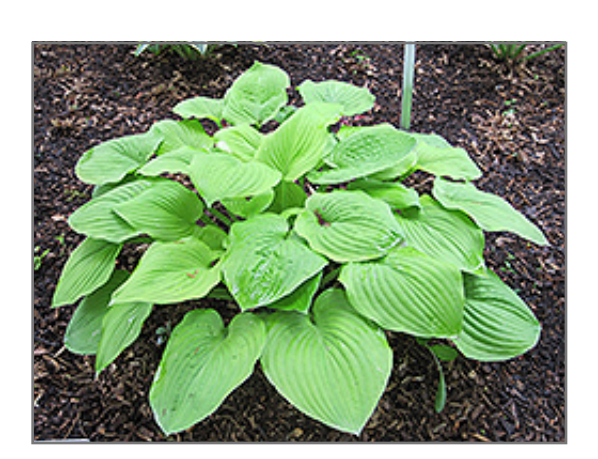
August Moon Hosta