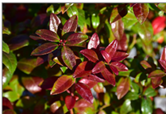
Blueberry Glaze Blueberry in fall