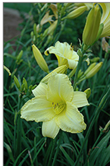
Happy Returns Daylily flowers