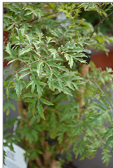
Ming Aralia foliage