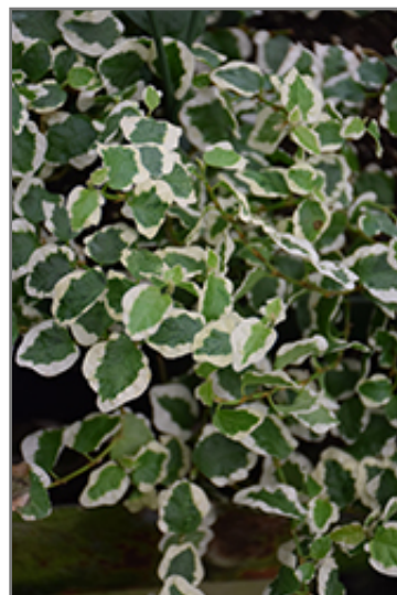
Variegated Creeping Fig foliage

When grown indoors, Variegated Creeping Fig can be expected to grow to be about 8 feet tall at maturity, with a spread of 3 feet. It grows at a fast rate, and under ideal conditions can be expected to live for approximately 50 years. This houseplant performs well in both bright or indirect sunlight and strong artificial light, and can therefore be situated in almost any well-lit room or location. It does best in average to evenly moist soil, but will not tolerate standing water. The surface of the soil shouldn't be allowed to dry out completely, and so you should expect to water this plant once and possibly even twice each week. Be aware that your particular watering schedule may vary depending on its location in the room, the pot size, plant size and other conditions; if in doubt, ask one of our experts in the store for advice. It is not particular as to soil type or pH; an average potting soil should work just fine.