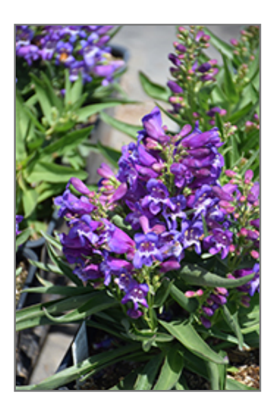
Rock Candy Blue Beard Tongue flowers

This is a relatively low maintenance plant, and is best cleaned up in early spring before it resumes active growth for the season. It is a good choice for attracting butterflies and hummingbirds to your yard. It has no significant negative characteristics.