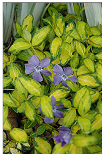
Illumination Periwinkle flowers

Illumination Periwinkle is recommended for the following landscape applications;