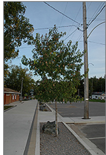
Amur Maple (tree form)