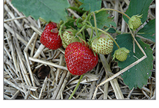
Everest Strawberry fruit