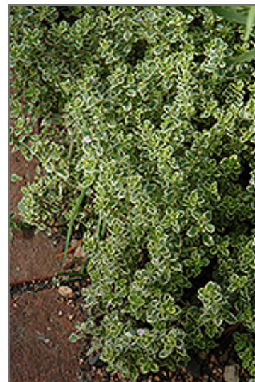
Aureus Lemon Thyme foliage